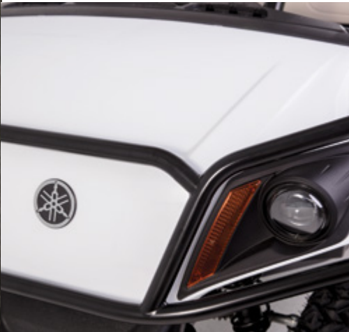
Front brush guard is made of 3/16" steel, 1" round tubing, and 1-1/2" round tubing. Powder-coated for protection.

Whether you're maintaining the greens or hauling gear for a weekend camping trip, the Adventurer Sport 2+2 — and all 300 pounds of its payload capacity — will be right there pulling for you. Of course, if you're in the mood for a bit of recreational off-roading, it's ready for that too!